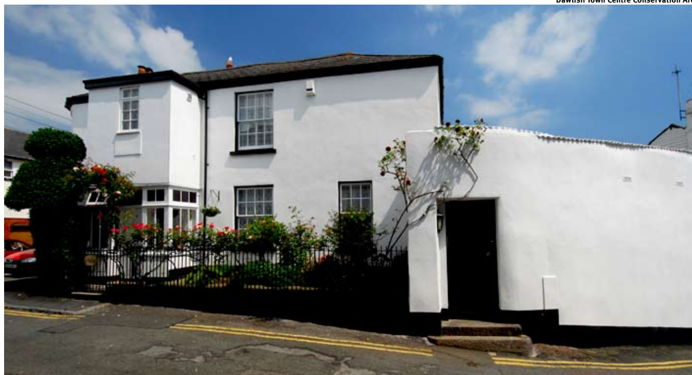
Dawlish Town Centre Conservation Area