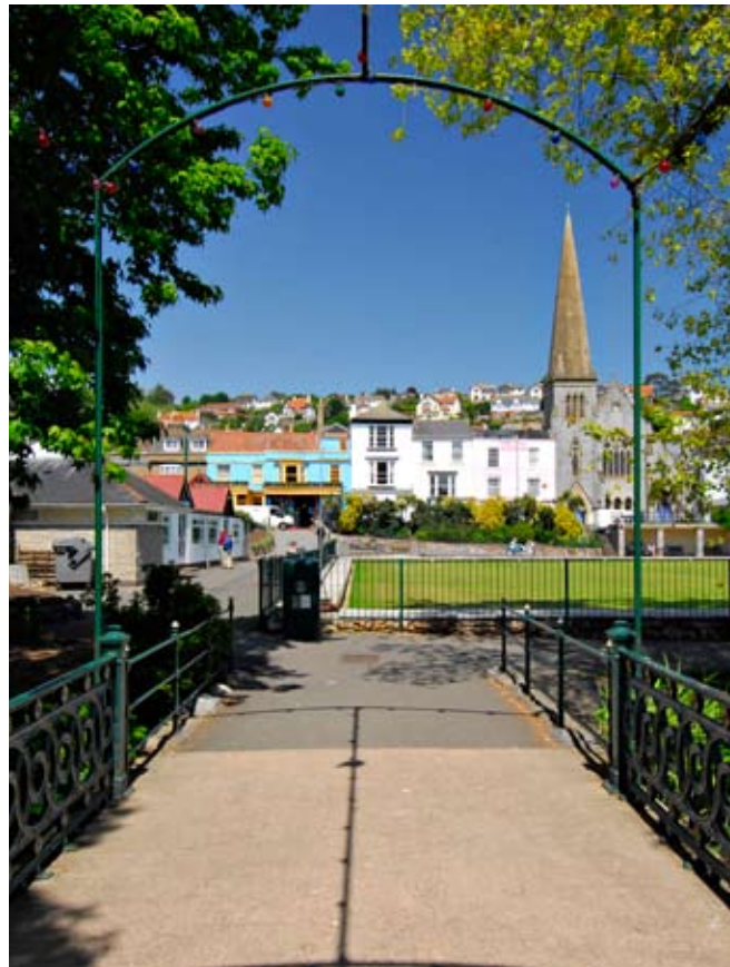
The Lawn and bowling green

"...a comprehensive master plan for the Town Centre. It is to address shortcomings in the functioning of the central area,